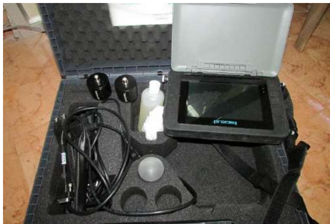
Ultrasonic pulse velocity test