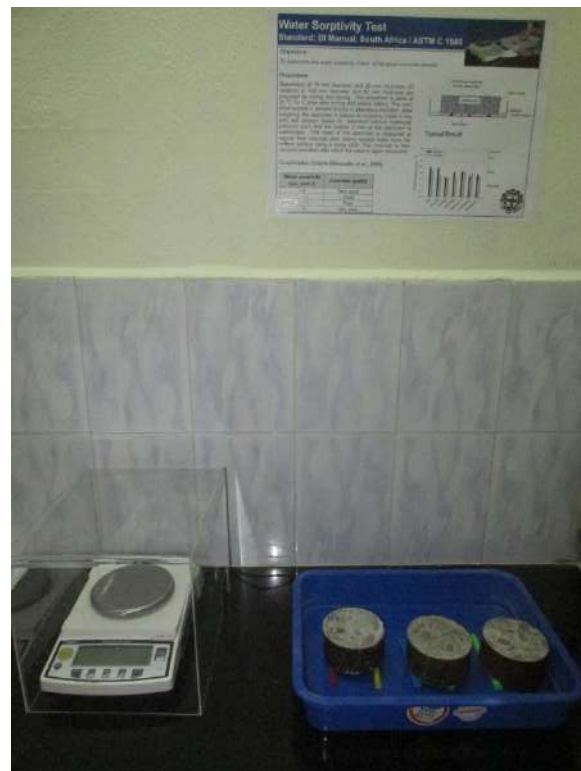
Water sorptivity test