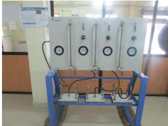
Water permeability test