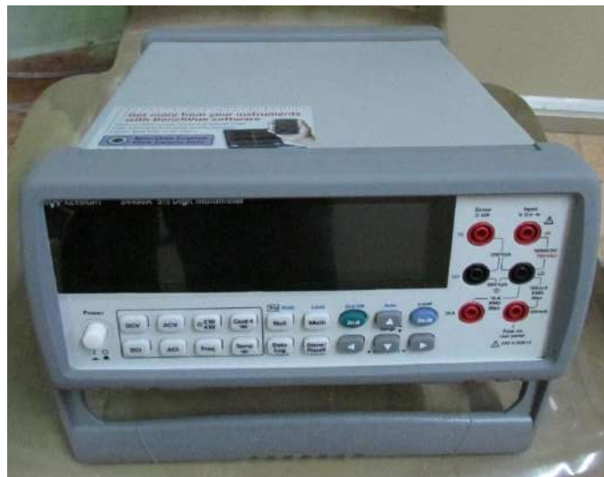
5.5 digit high precision multimeter