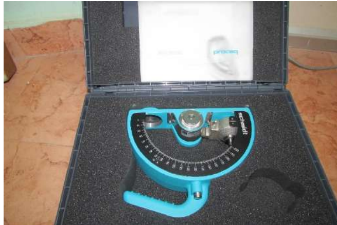
Pendulam type rebound hammer