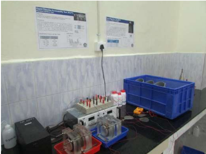
Rapid chloride permeability test