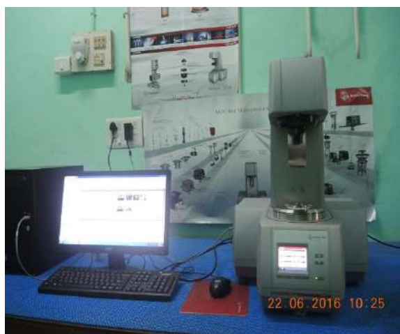
Dynamic Shear Rheometer