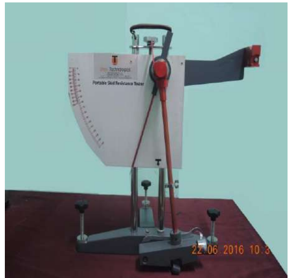
Pendulum skid-resistant tester