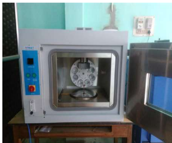
Rolling Thin Film Oven (RTFO)