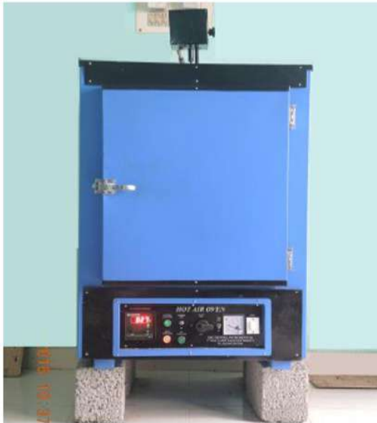
Bitumen Blending Oven